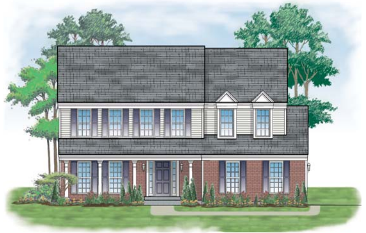
Elevation 1 shown with Optional side load Garage, full front Porch and brick front