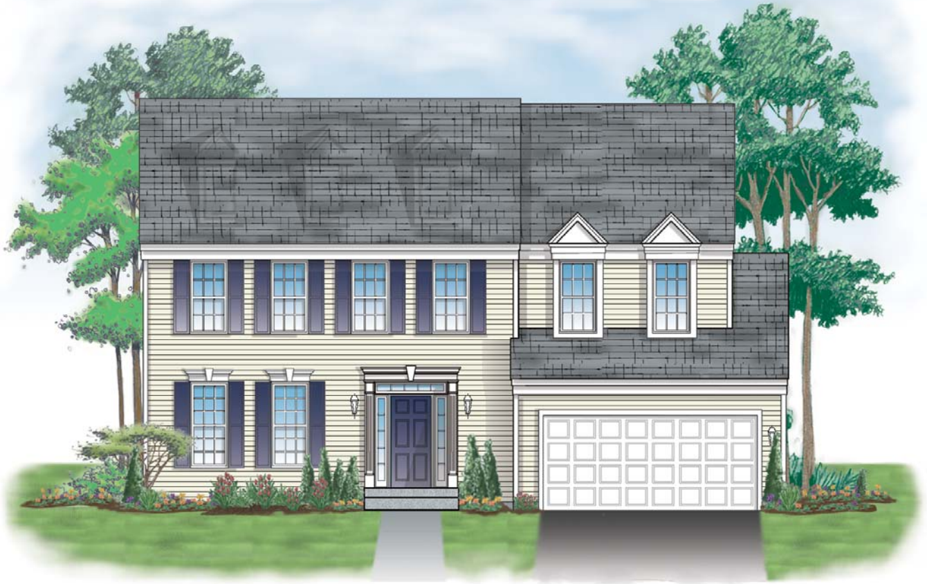
Elevation 1 standard