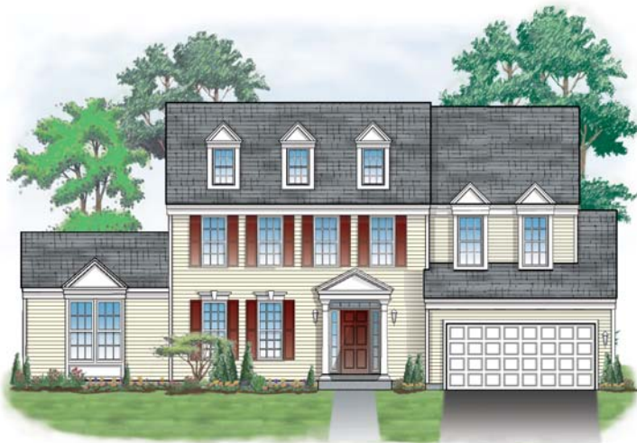
Elevation 1 shown with Optional covered Porch, Dormers and Conservatory