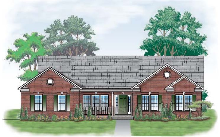
Elevation 2 shown with optional turned gables, brick front, and side load garage