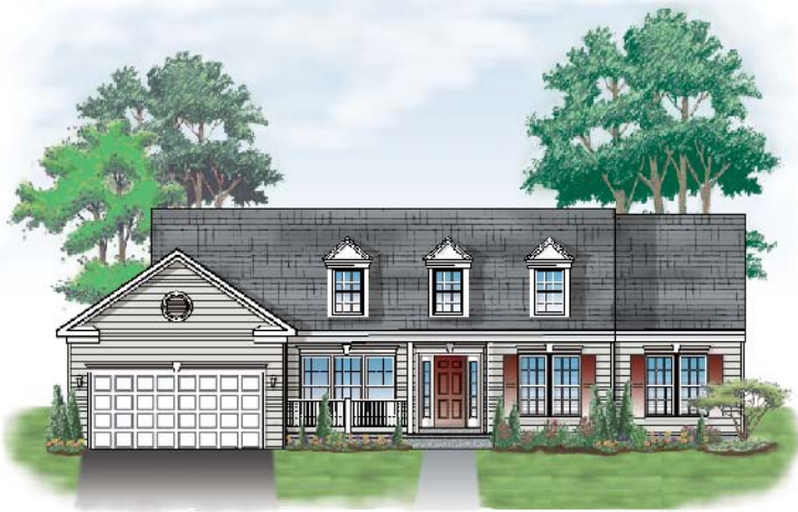
Elevation 1 shown with optional dormers